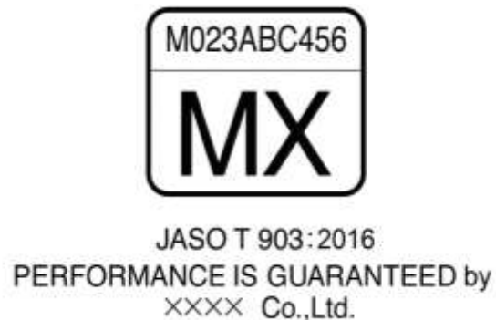
1.5 x Dimensions