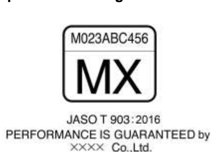
Mark with Dimensions Specified in Item 1.1 of Appendix 5